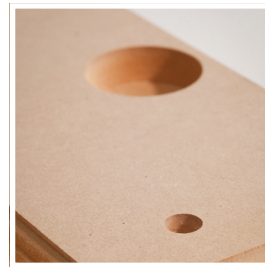
Table of dimensional tolerance for all Customwood MDF Panels